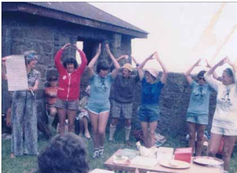
Entertainment at the Bellbird

Noshes were held every mid winter, occasionally mid summer too, and always at the Bellbird, until with over 80 members being catered for, we reluctantly switched venues; these recent ones are warmer and more comfortable, but in those days the fire and freezing cold were part of it!