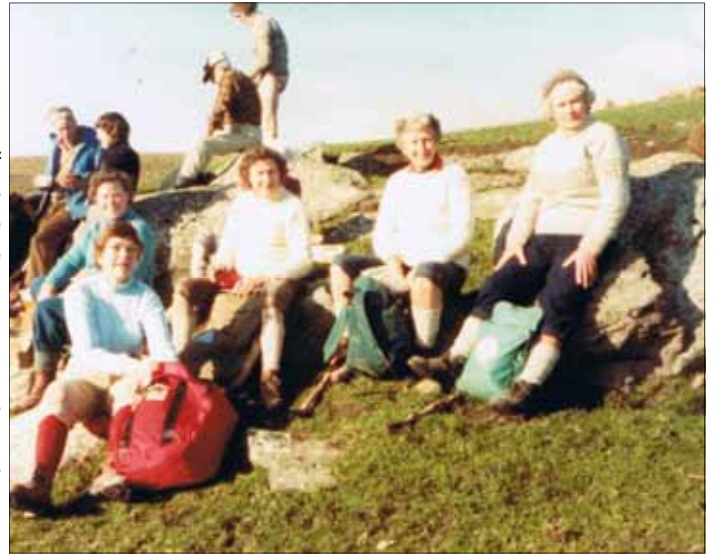
This photo is dated 1983