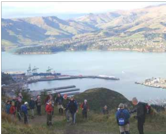
Bridle Path to Lyttelton & return June 24—Cathie Graves