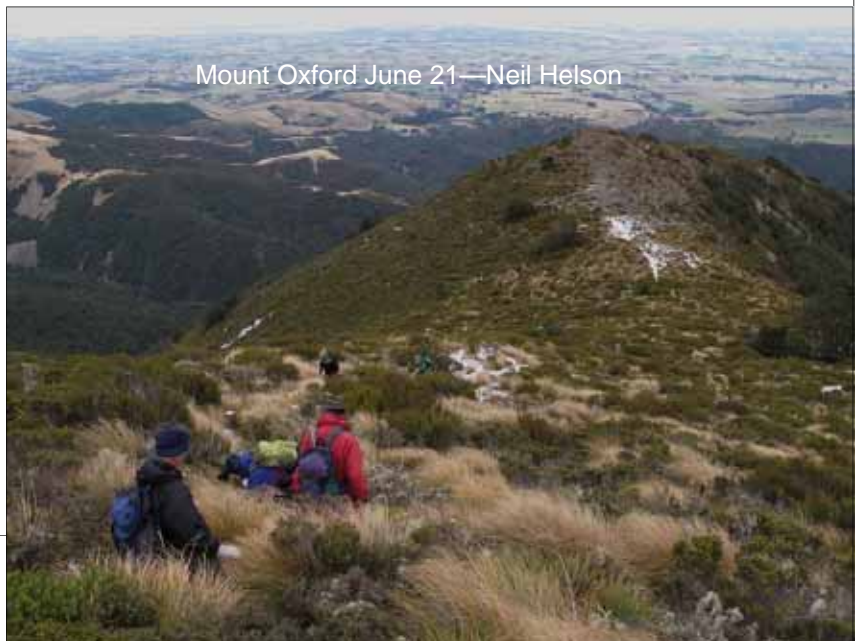
Mount Oxford June 21—Neil Helson